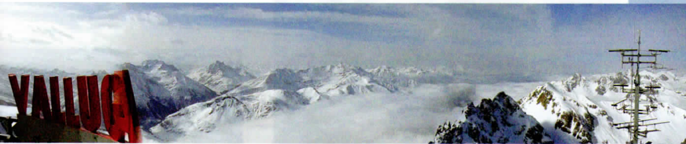
The view from the platform atop the Valluga.

enormous interconnected ski region that encompasses the resorts of Lech, Oberlech, Zürs, Zug, Stuben, Stubenbach, Warth, St. Christoph, Klösterle, and St. Anton. The name is likely derived from the Arlenbush, a common local shrub. It is among the oldest destination ski regions in the world, and it has a connection to New England.