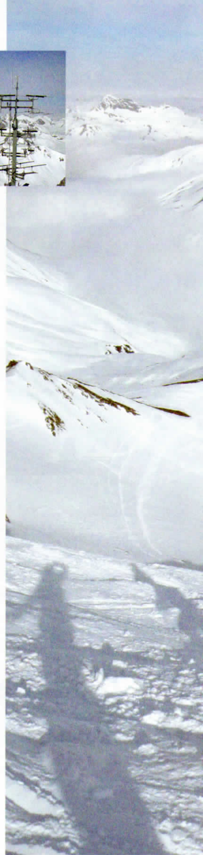
Skiers in the no-fall zone on the Valluga.

And the rest of the Arlberg too. It's a skiing destination that offers terrain as challenging as any skier could want, more mileage than one can ski in a week, and full immersion in Austrian ski culture and history. 🍷