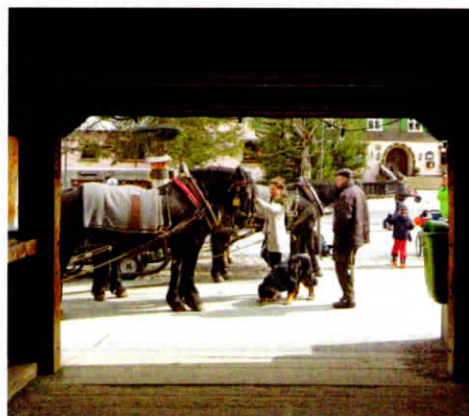
From top: Historic Lech. The author making turns down a sunny slope. Horses beyond the covered bridge in Lech, ready for rides.