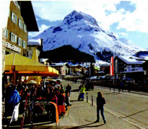
From top: Historic cabin in Lech. Gondola in St. Anton. Lech village.