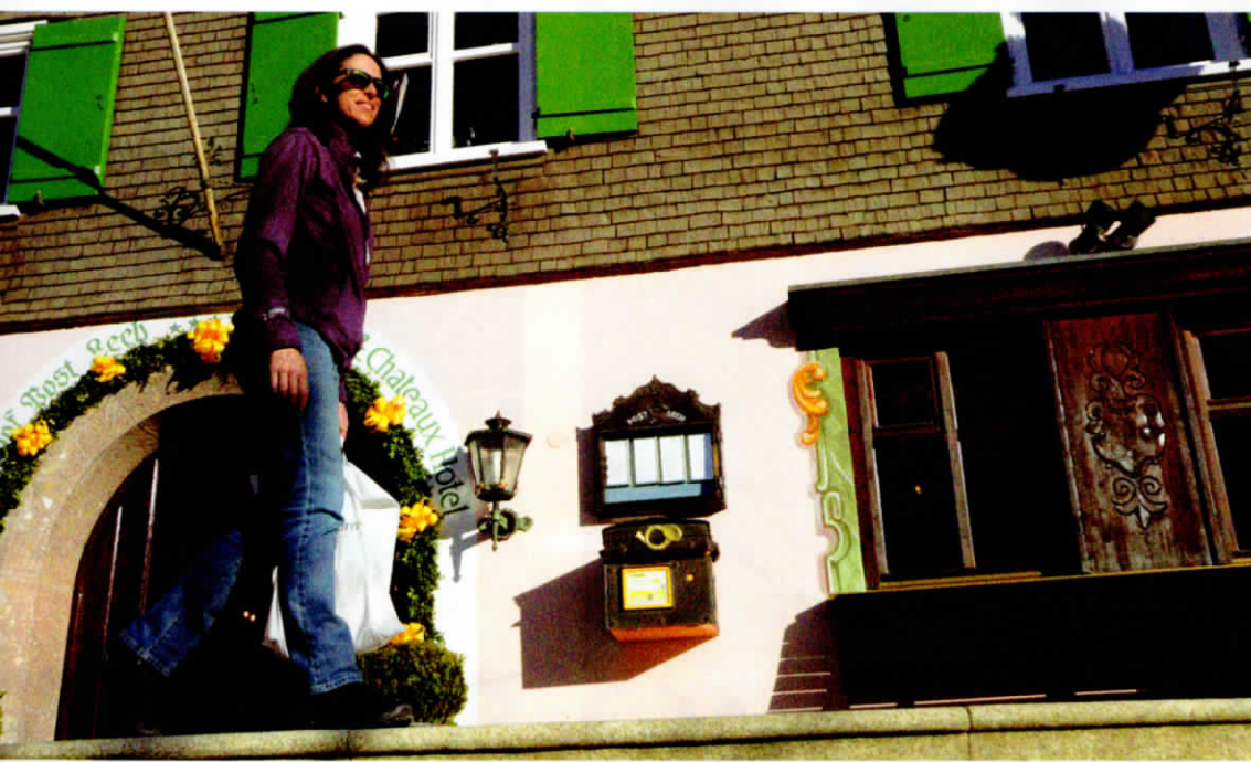
Above: The author by the Post Hotel in Lech.