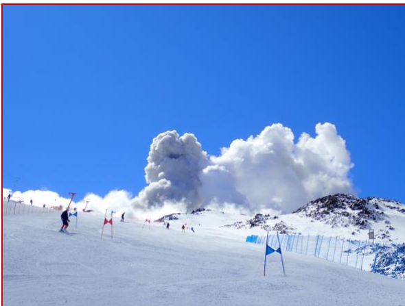
The race hill at Nevados de Chillan under a volcano!

Travel insurance is strongly recommended for all camp participants! The camp suggests AIG Travel Guard .