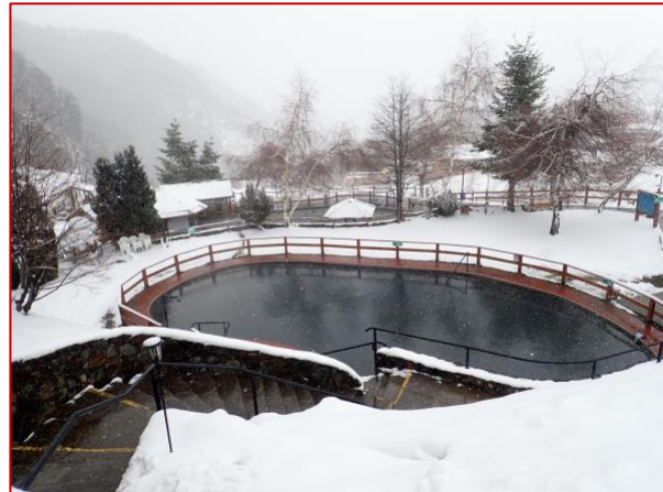
One of three natural thermal pools at the hotel.