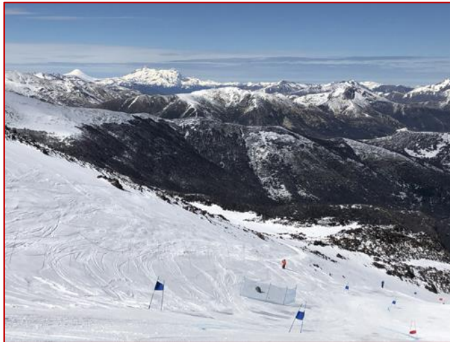
Breathtaking view of the surrounding Andes from the race hill.